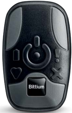
Built-in arrhythmia detection

Informative reports include all important arrhythmia statistics and results displayed in an easy to read form. Modify the results through quick analysis and approval of events, and select which events are added to final report.